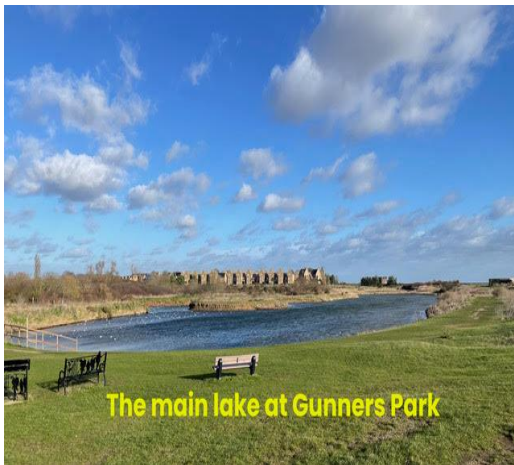
The main lake at Gunners Park