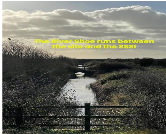
The River Shoe runs between the site and the SSSI