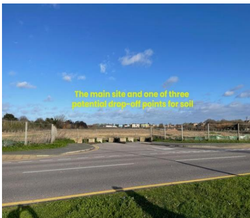
The main site and one of three potential drop-off points for soil