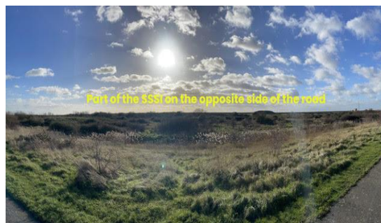
Part of the SSSI on the opposite side of the road